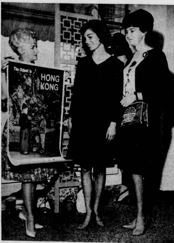
FARAWAY PLACES ARE CALLING

The Torrance Junior Womens Club is affiliated with the Marina District, Calif. Federation of Womens Clubs, Junior membership.