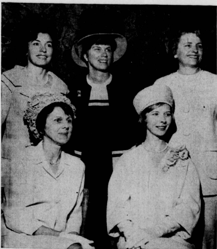
ASSUME OFFICIAL DUTIES