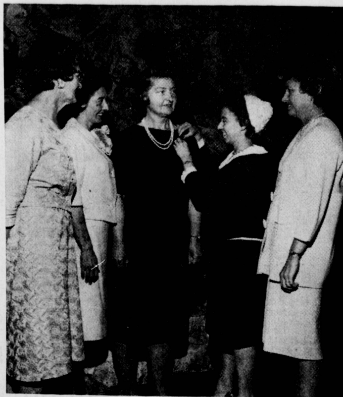
SETS SERVICE HOUR RECORD