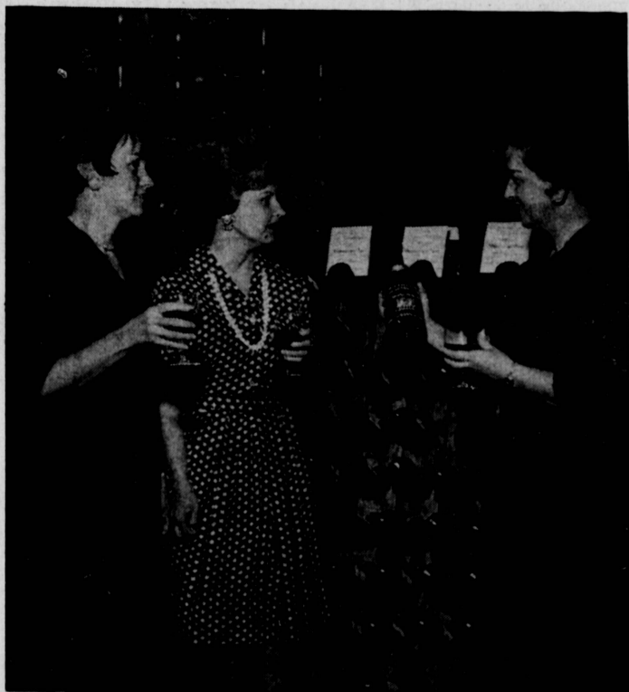
VISIT THE WINE CELLAR