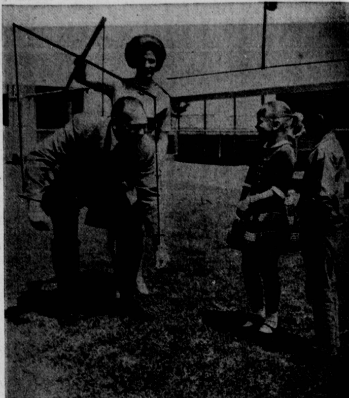
THE FANTASY OF PUPPETRY