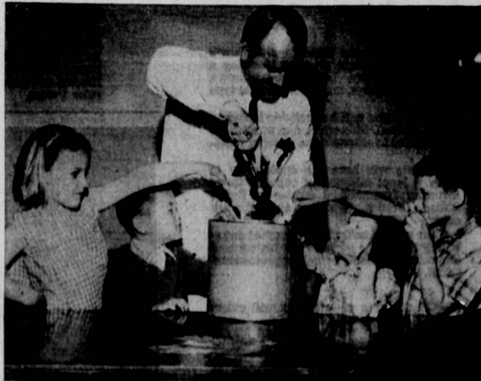
IT'S TIME TO DIG IN