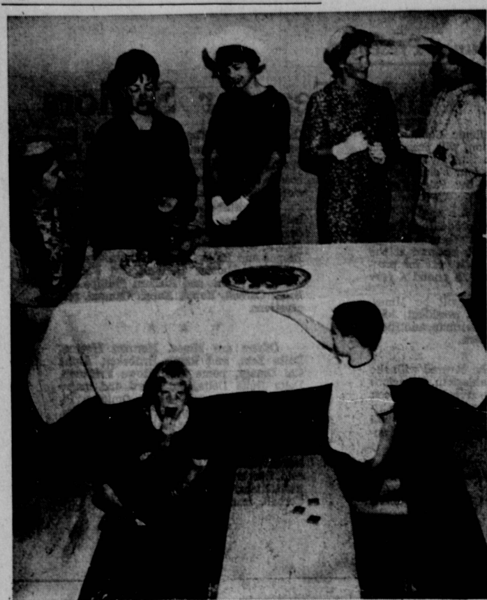
PLANNING NEW MEMBERS TEA