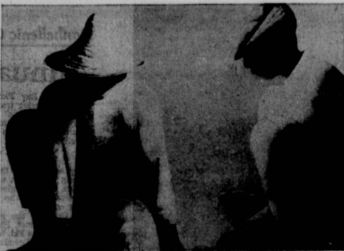
MEXICAN CONTEMPORARY ART