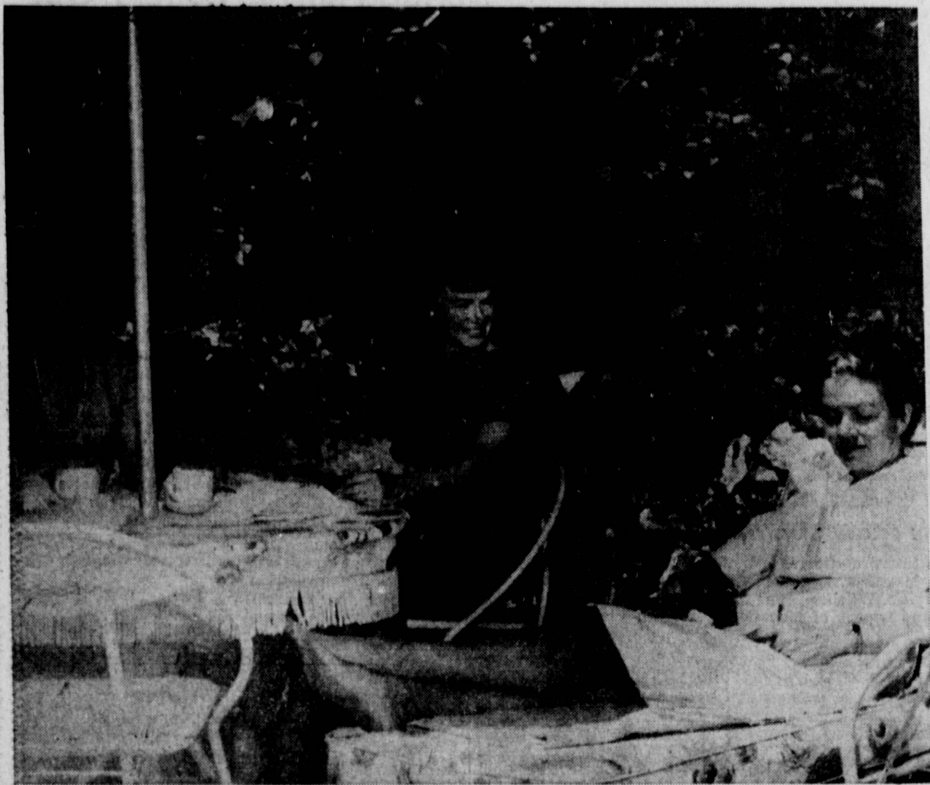
SPRING IS "BUSTIN' OUT ALL OVER"

For eighteen consecutive springs, the South Bay Panhellenic Council has chosen the month of May for its "Pink Tea" for senior girls of the area high schools, who plan to attend a four-year college. At the tea, to be held May 1 at the Palos Verdes High School, seniors and their mothers will learn sorority rush and recommendation procedures and will see a parade of campus fashions. Pink blossoms and