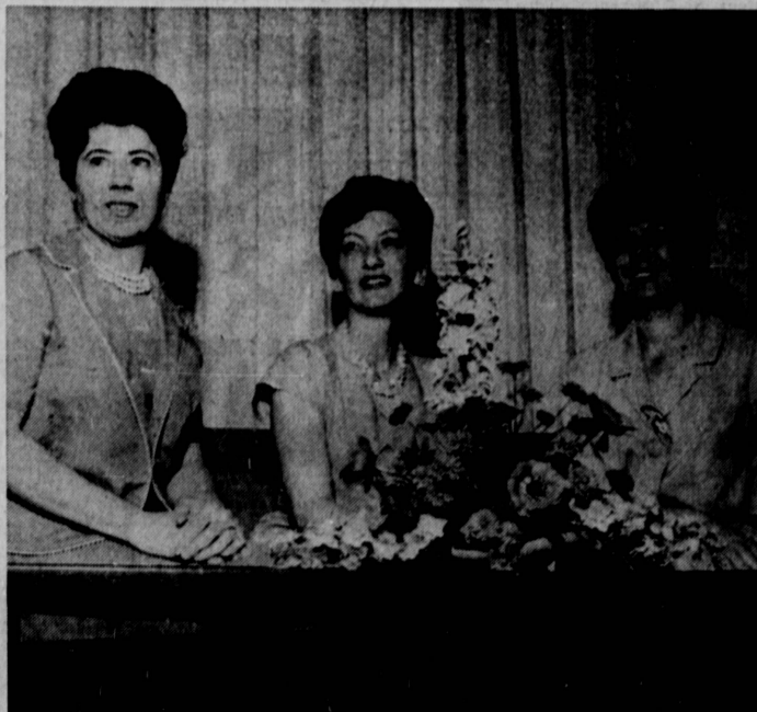
NEW B'NAI B'RITH CHAPTER LEADERS