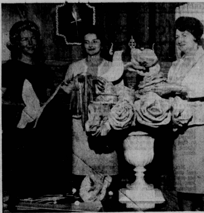
MEMORIES OF GAY PAREE