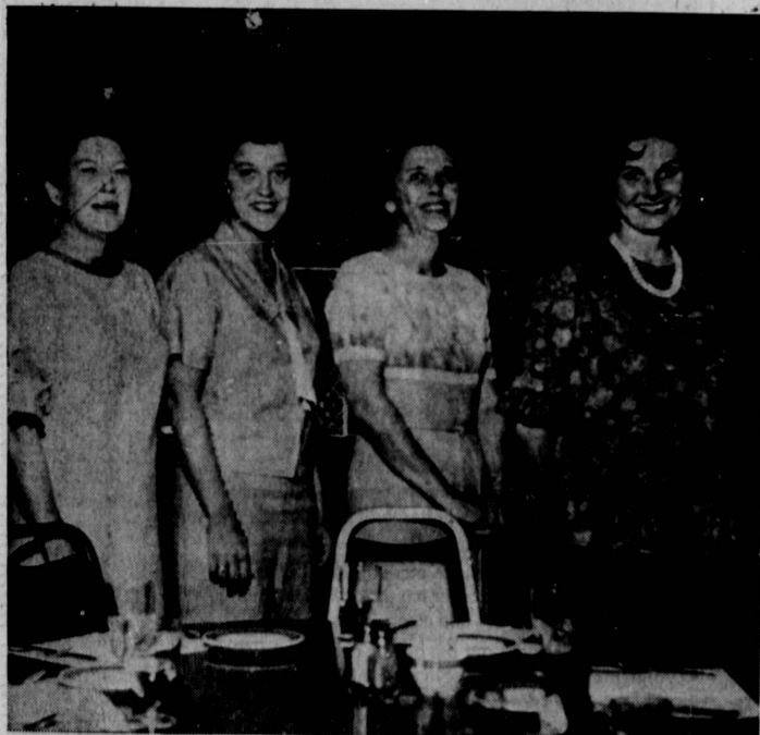
AT THE HELM