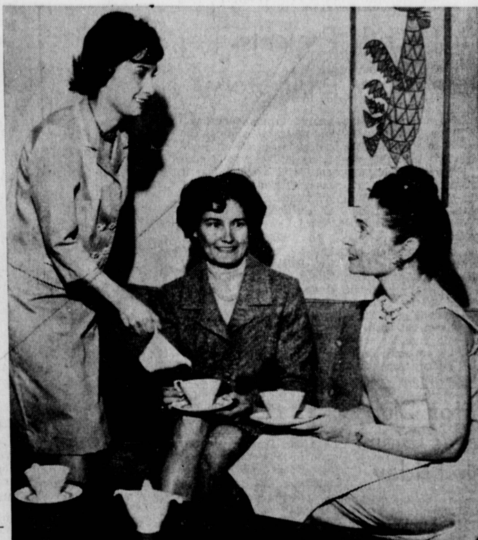
RECALL DAYS AT ALMA MATER