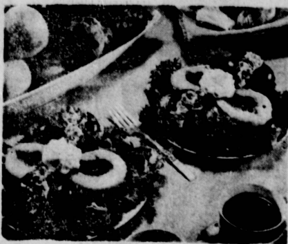
FOR A COLORFUL summer salad, combine fresh peach halves, whole plums, cream cheese and nuts, serving the fruits on a bed of endive or lettuce.