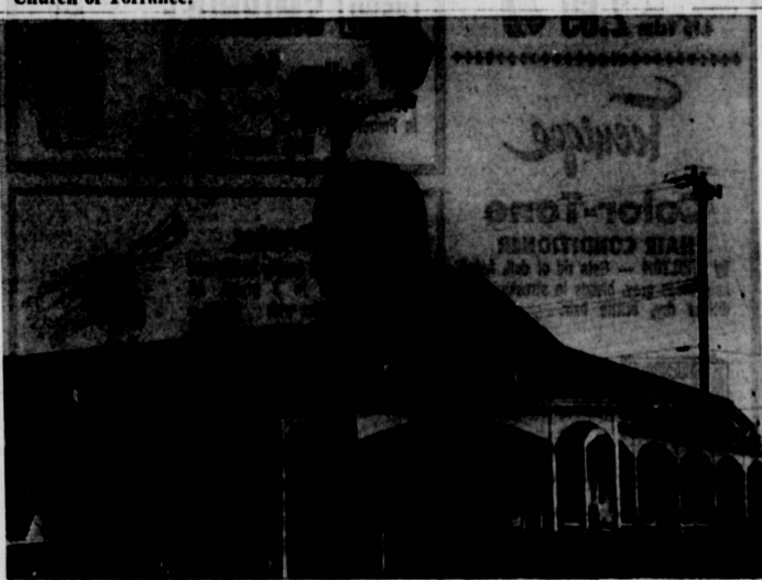
A FAMILY RESTAURANT . . . The coloriul Red Balloon is perhaps one of the most popular family restaurants in the South Bay Area. Steaks, seafoods, choice desserts and children's plates are served at moderate prices. The immaculate eatery, managed by Clara Dahlke, is located at 17344 Hawthorne Blvd., Torrance