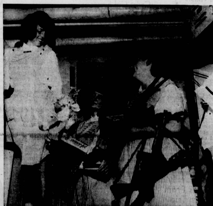
Take One More

2. To be used as a recruitment mechanism by exposing young people to practical ap-plication of working hospital