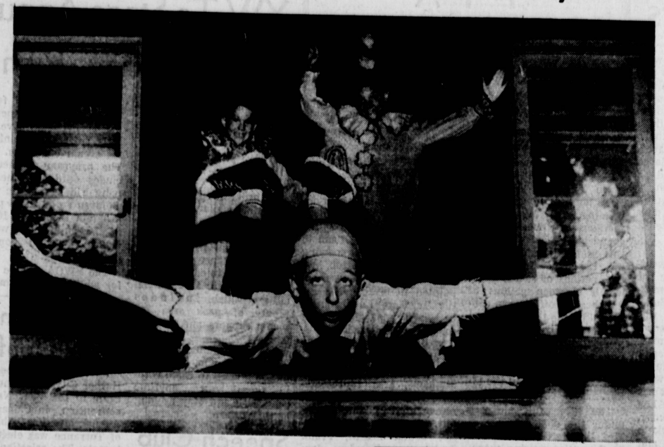
Art of Entertaining