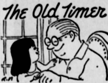
"One of the most influential handclashes is that of a grandchild around the finger of a grandparent."