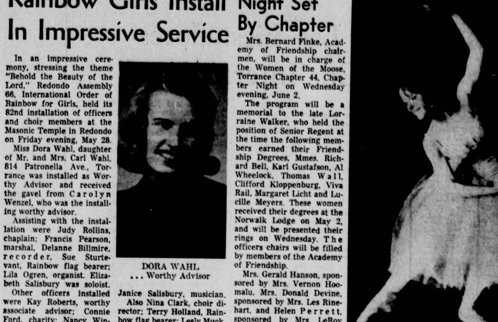
In Benefit Ballet Concert

1st Church of Christ, Scientist 1750 Manuel Ave.