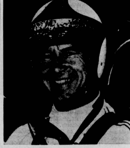
PARNELLI JONES . . . 1963 Indianapolis 500-mile winner, is expected to be back in the race Monday. His Lotus-Ford has been repaired following a practice run crackup 10 days ago.

A workshop will be held at Walteria Park Saturday from