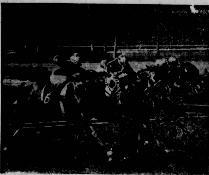
CHARGE TO THE FINISH... Thoroughbreds and their jockeys go all out in charge for the finish in typically thrilling action at Hollywood Park, the beautiful "track of the lakes and flowers" in Inglewood where racing will be conducted