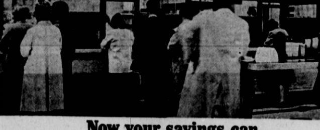
Now your savings can receive the security of a bank