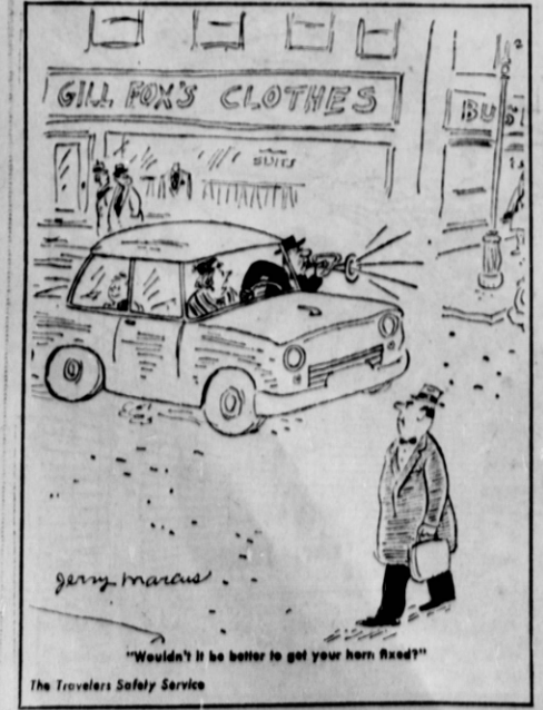
Bad driving manners contribute heavily to highway