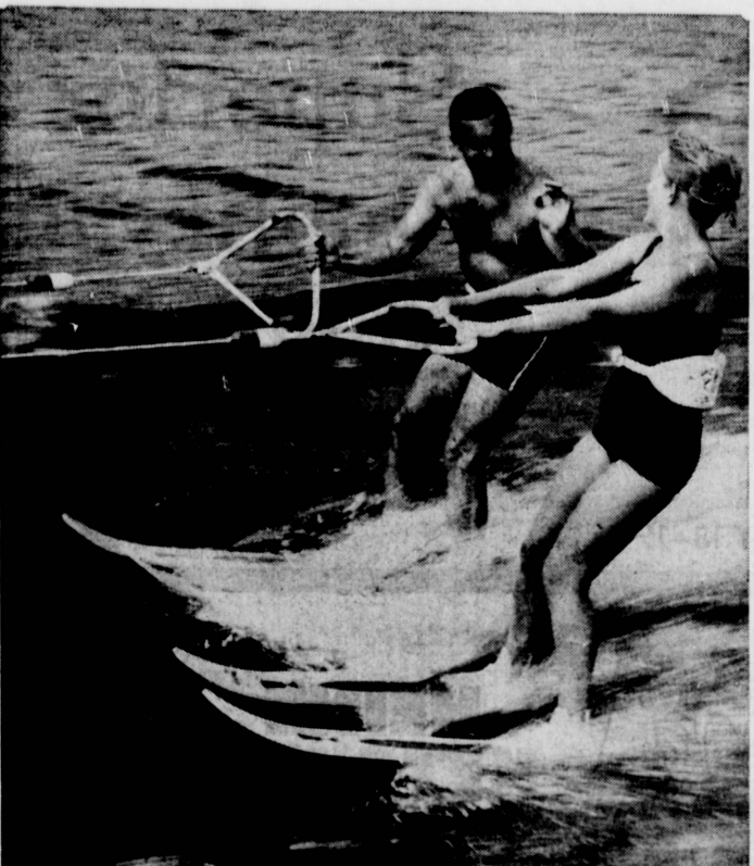
FREE-WHEELING... Learning to water ski is easy and can be loads of fun. With proper instruction, this lass has picked up the basic ideas in one session with a good instructor and is ready to go on and master one of summer's most exhibarating sports.