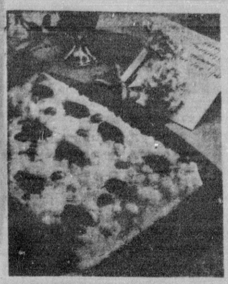
MOTHER'S DAY DAZZLER, on upside-down cake the children can make on HER day, is a hand-some sight to behold with its topping of canned fruit cocktail and its delicate pink tint imported by