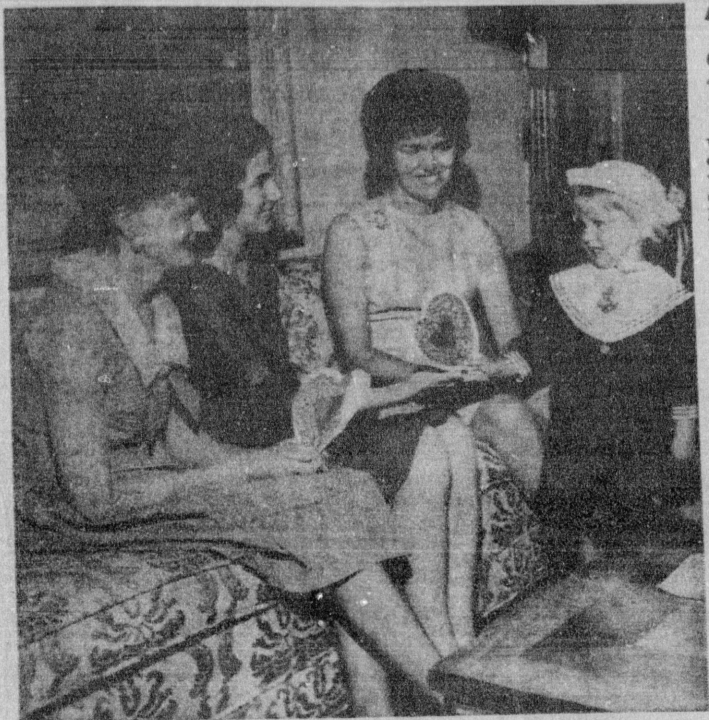
May Day For Ladies