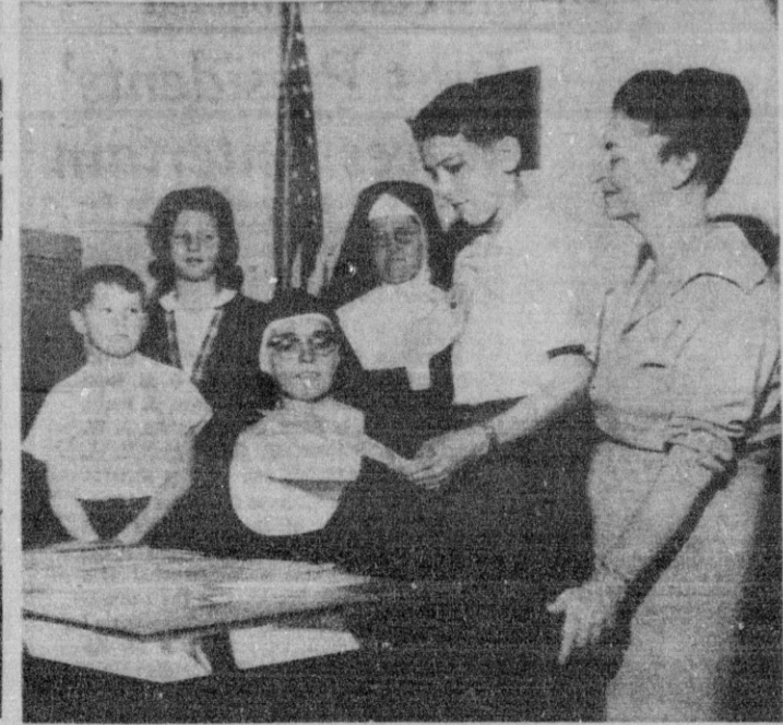
Young Poets Honored

Riviera Garden Club will many exhibits in the show, resent its annual Flower in various age classifications. With the addition of the Camp Fire Girl exhibits, an unusually large childent in the camp facilities an unusually large childent in the camp facilities.