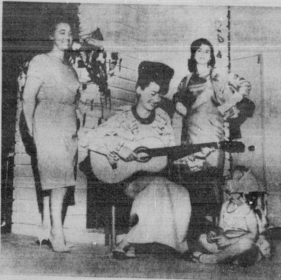
Symphony in Blue

A kaleidoscopic presentation of spring's lovely new colors will be presented by members of the Torrance Junior Woman's club and their children at the "Spool and Bobbin" Show Wednesday evening at the clubhouse. Wearing creations which they have designed and made, these club members featured the many new shades of blue. From the left, Mrs.