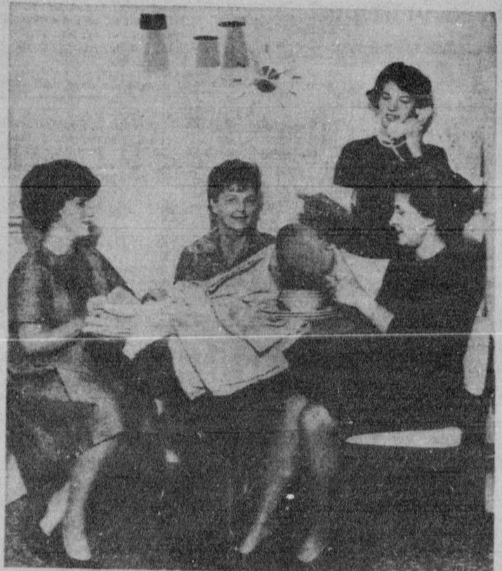
Collect For Mexican Refuge