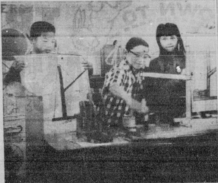
BUILDING CRANE... Three fifth grade students at Arlington School will enter a motorized crane which they are building in the Arlington School Science Fair.