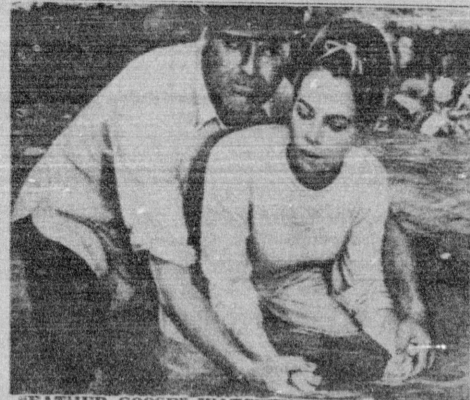
"FATHER GOOSE" WATCHFUL... Cary Grant with Leslie Caron proves that he doesn't need to look suave to be popular, in the film now at United Artists Theater.