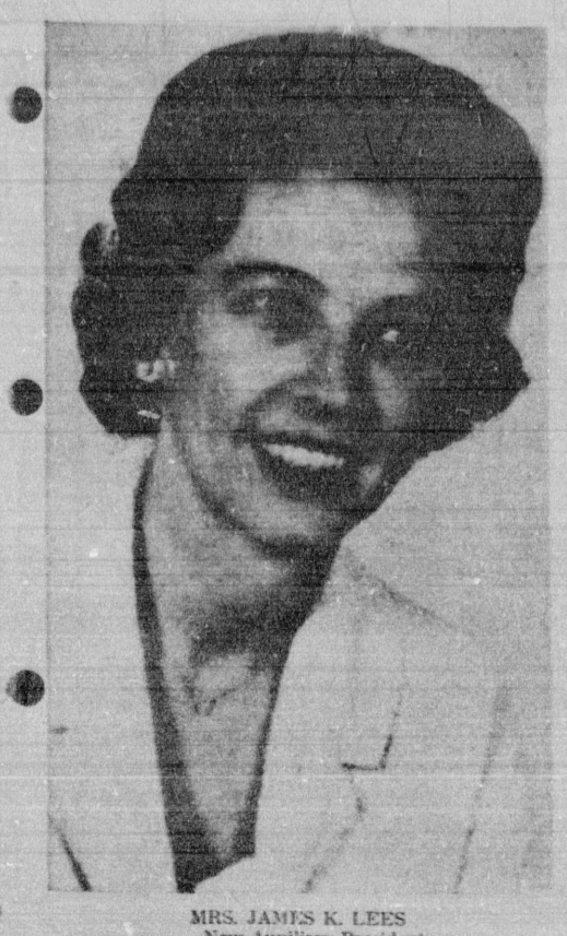
.. New Auxiliary President (Portrait by Seeman) Installation April 6