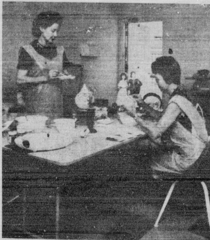
HOBBY CENTER . . . Ceramics is enjoyed by more than 100 of the residents of New Horizons South Bay in Torrance. Residents of the complete adult recreation community enjoy dozens of recreation activities, in and operating now.