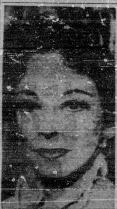
TALENTED . . . Lovely Signa Hasso is member of National Repertory Theatre now at Huntington Hartford Theatre, as star of Ibsen's "Hedda Gabler." Trio of plays also includes "She Stoops to Conquer" and "Lillian."