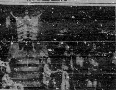
"WATER GODDESS" . . . exemplified in dance to "Aztec Gods" by Ballet Folklórico de Mexico to be danced during their presentation in the Music Center Feb. 8 through 24.

BE SURE . . . See the superb Italian film of Rossini's "Barber of Seville," in color in UCLA's Royce Hall at 8 p.m. Saturday night, with Tito Gobi, Giulietta Simonato and the late Giulio Neri.