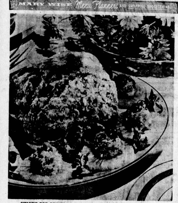
WHAT'S FOR DINNER on Easter? Stuffed roast shoulder of lamb, of course. And that's good news for the cook because she can use a ready-mix combread dressing, simply adding pineapple and mint to bring out the succulent flavor of the lamb.