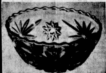
5 1/4 Inch Cut Bowl

19 c Each All Above Items with each $2.00 purchase excluding liquor, milk & tobacco