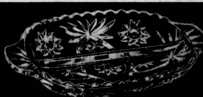
10 Inch Divided Relish Dish

29 c Each with each $2.00 purchase excluding liquor, milk & tobacco