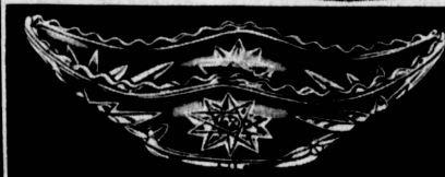
9 3/8 Inch Gondola Dish