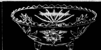
6 1/4 Inch 3-Toed Dish