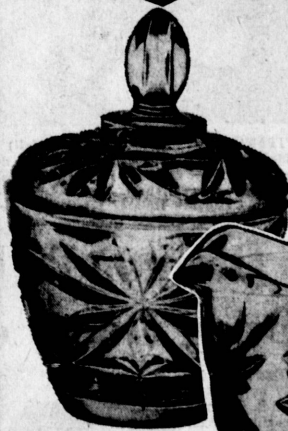
Creamer and Sugar with Cover

Featuring all the beauty and charm of Early American cut crystal