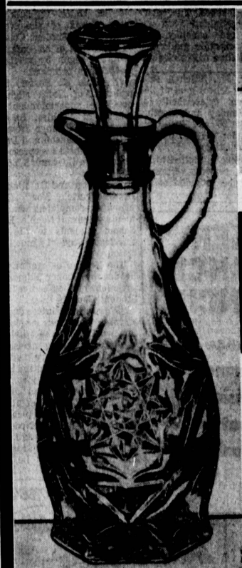
7 3/4 Inch Cruet and Stopper

19 c Each All Above Items with each $2.00 purchase excluding liquor, milk & tobacco