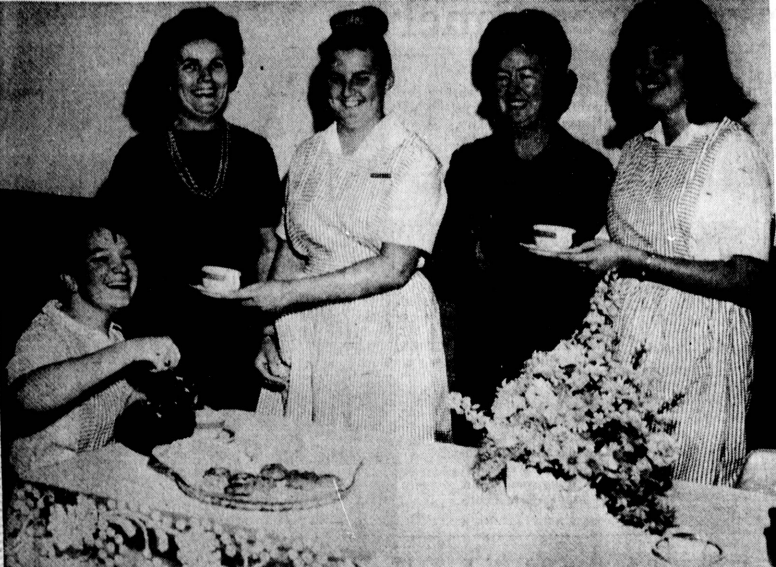
RECOGNITION TEA FOR CANDY STRIPERS

Second anniversary of the Candy Striper program at Torrance Memorial Hospital was noted last Sunat Torrance Memorial Hospital was noted last Sunday afternoon with a Mother-Daughter Tea at the hospital. During the tea. certificates we're presented to the teen-age girls who had completed 50 hours of service, and pins were given to those girls who had served more than 100 hours. In this