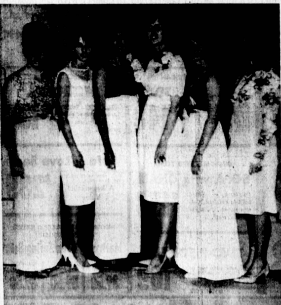
GUESTS OF HONOR

The District 4 Annual Donor Luncheon will be held at Cocoonut Grove, Ambassador Hotel, included in the afternoon's entertainment will be a presentation of "Fiddler on the Roof."