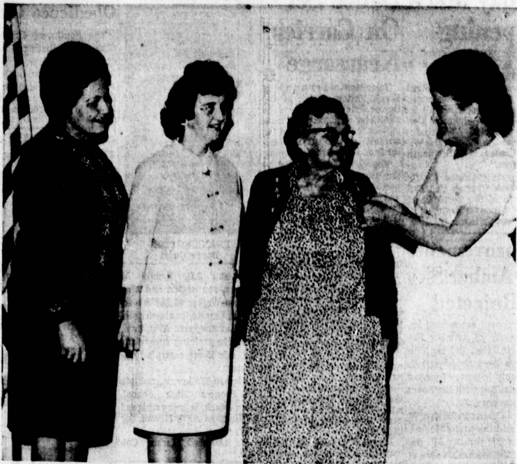
HIGHLIGHT OF GRAND REGENT'S TERM