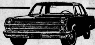
NEW 1966 AMBASSADOR SEDAN STOCK NO. 6AB56 $2703

OVER 30 NEW '65 AND EXECUTIVE RAMBLERS WITH WARRANTY AT LARGE SAVINGS