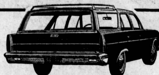
NEW 1966 RAMBLER WAGON CLASSIC — STOCK NO. 6C181 $2413