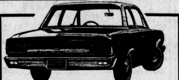
NEW 1966 AMERICAN 2-DOOR SEDAN—STOCK NO. 172 $1795