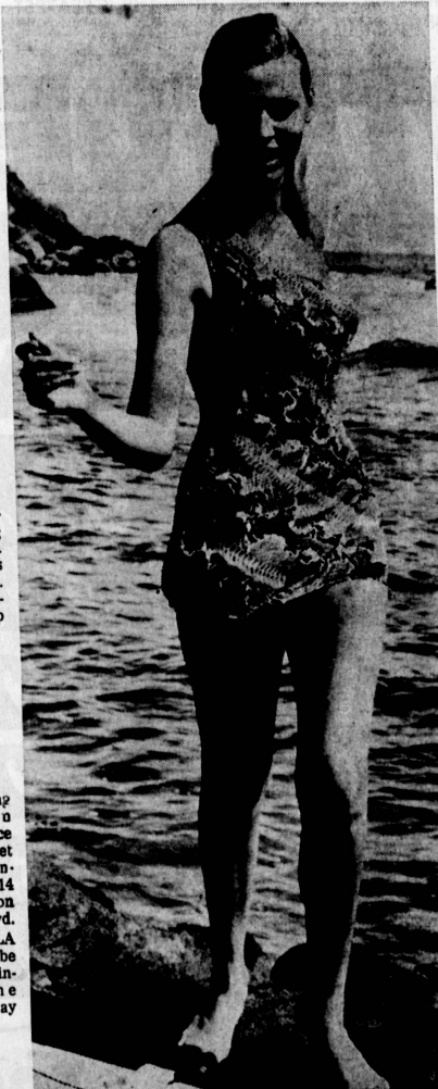
HIGH FASHIONS HIT BEACH