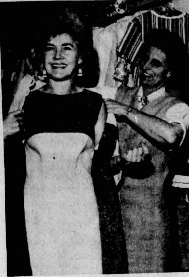
PARADE NEW FASHIONS