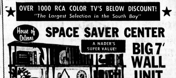
SPACE SAVER CENTER A NADER'S SUPER VALUE! BIG 7' WALL UNIT ENTIRE UNIT ONLY $59.88 $1 WEEK NO CASH DOWN

OVER 1000 RCA COLOR TV'S BELOW DISCOUNT! "The Largest Selection in the South Bay"