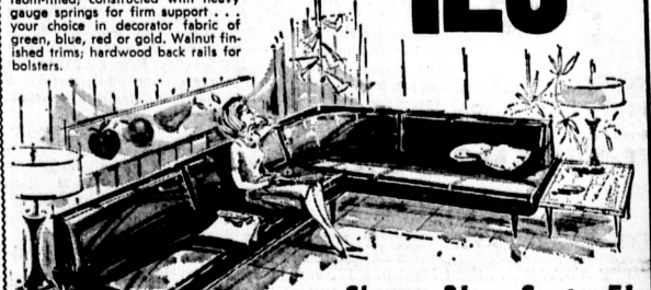
Sleeps 2! Seats 5! Overall left sofa: 98 1/2" Overall right sofa: 72 1/2" Overall length - 14 feet

All Foam Corner Group ... a fabulous teaming every smart decorator looks for. Each unit is foam-filled; constructed with heavy gauge springs for firm support... your choice in decorator fabric of green, blue, red or gold. Walnut finished trim; hardwood back rails for bolsters.