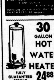
30 GALLON HOT WATER HEATER FULLY GUARANTEED REBUILT 2488

Your Choice! A ANY BRAND B ANY QUALITY C ANY STYLE OR FURNITURE OR APPLIANCE MAY BE PURCHASED AT NADER'S