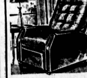
ELECTRIC VIBRATOR RECLINER Adjustable Speeds Choice of Colors NADER'S SCOOP PRICE $49.88