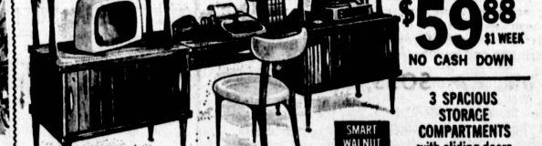
3 SPACIOUS STORAGE COMPARTMENTS with sliding doors APARTMENT OWNERS! YOU ARE INVITED TO VISIT NADER'S NEW AND USED CONTRACT DEPT. E-Z TERMS AVAILABLE

ADD A DECORATOR'S TOUCH OF VERSATILE BEAUTY TO ANY ROOM! You'll enjoy a wealth of storage and shelf space in this handsome 7 foot wall unit. There's a roomy desk with a wide drawer, 3 spacious compartments with sliding doors, and head of all ample shelf space for displaying treasured possessions. It's a solidly built... easily assembled... uniquely designed and richly finished in Walnut Color. Legs are self-leveling with brass finished tips.