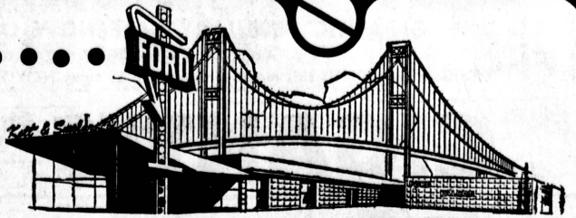
NEW CAR DEPT. & SERVICE TE 5-6621 — USED CARS TE 5-6624