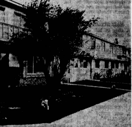
SCOTTSDALE TOWN HOUSES . . . A limited number of three-bedroom, two-bath models are now being offered for sale at $18,500 at Ray Watt's Scottsdale Town Houses development in Wilmington. Models are open daily from 9 a.m. until 10 p.m. on Avalon Boulevard between Carson Street and Sepulveda Boulevard, one mile east of the Harbor Freeway.