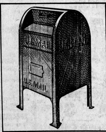
SAVE BY MAIL: LET THE POST OFFICE DO THE WORK

It shows you every transaction made during the quarte deposits, withdrawals, and the amount of interest you have earned and been credited for, and what your balance is.