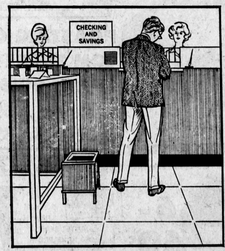
ALL SAVINGS BUSINESS IS TRANSACTED FASTER

Our new automated system-Statement Savings-is a great advance in modernizing savings procedures and bookeeping. It saves you time, money, and bother. And you still get City National's daily interest, compounded quarterly.