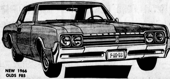
NEW 1966 OLDS F85