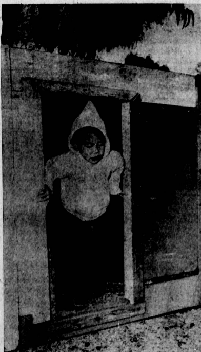
TIME TO EXPLORE