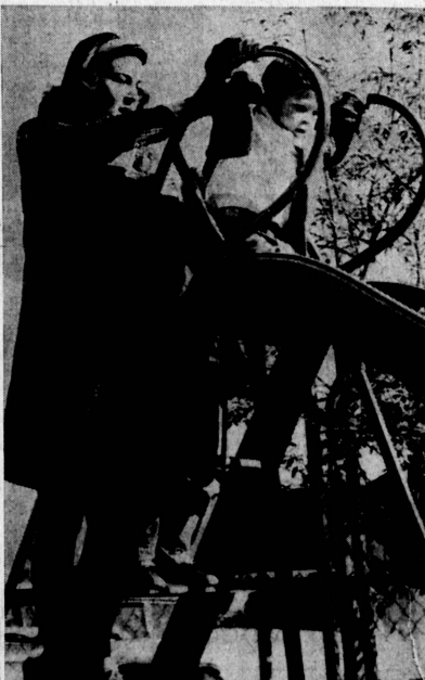
IT TAKES COURAGE