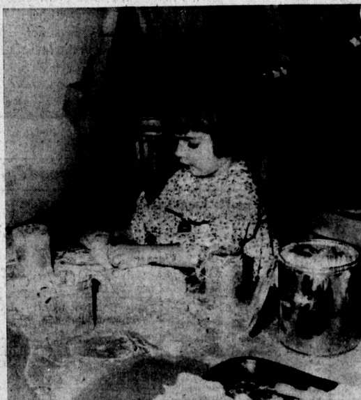
IN MOTHER'S FOOTSTEPS