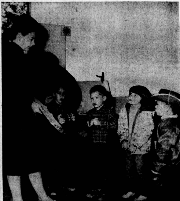
WE CAN'T FIND THE ANTS!

The Torrance Cooperative Nursery School is open to all 3 to 5 year-old youngsters of the South Bay area. For further information the school may be called.