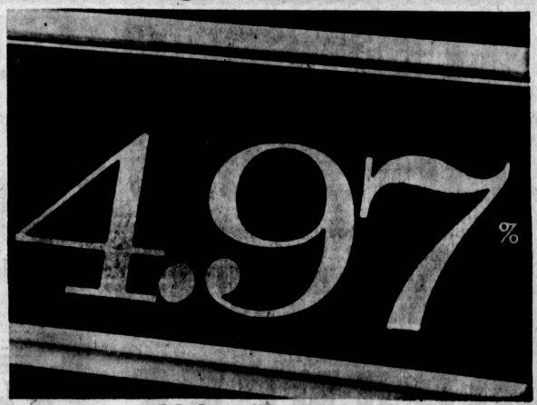
higher than 4.97%