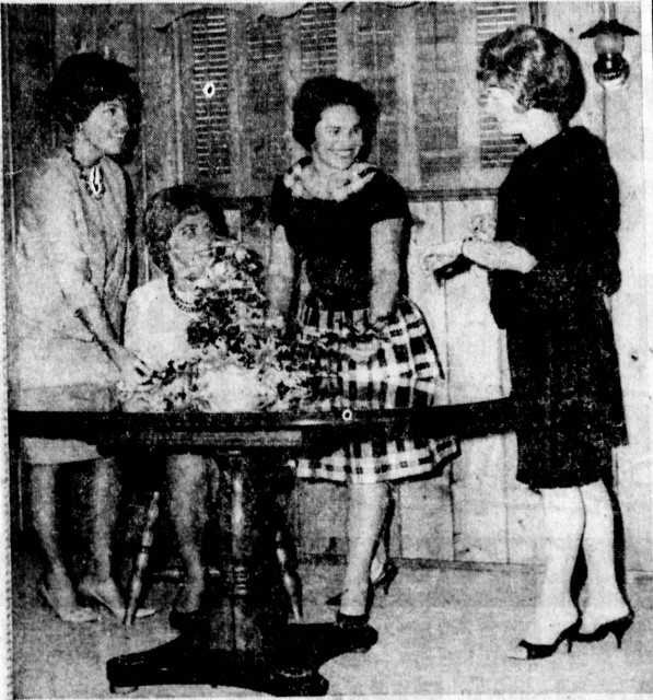
HOLIDAY PARTY TIME