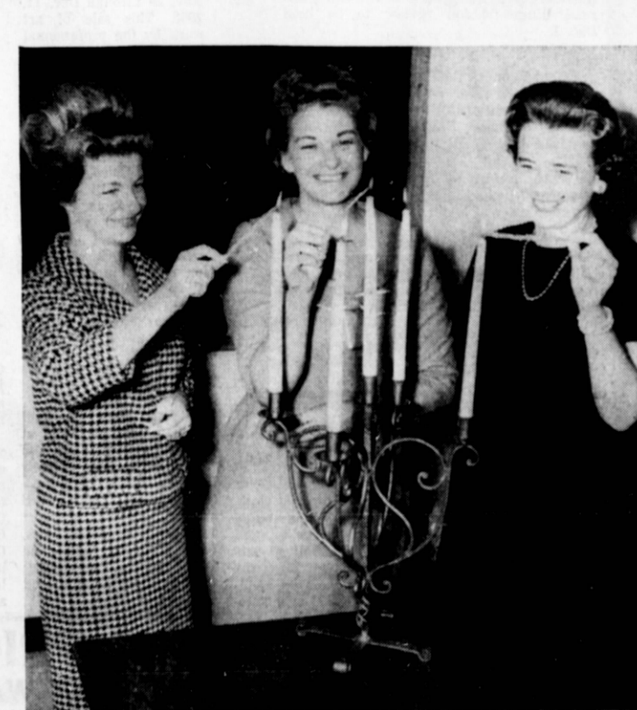
THE GLOW OF CANDLELIGHT

A social hour will begin at 7 p.m. followed by the fashion parade at 8. More than 40 prizes will be awarded during the evening and the major prize is an all-expense two night and three days in Las Vegas at the Hacienda Hotel. To this major prize, the Council will donate $200 to add to the holiday trip.