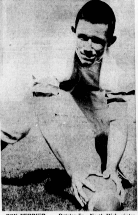
will be in the line-up Friday night when the Saxons invade Redondo High's Seahawk Field. The two teams will close out the Bay League football season.