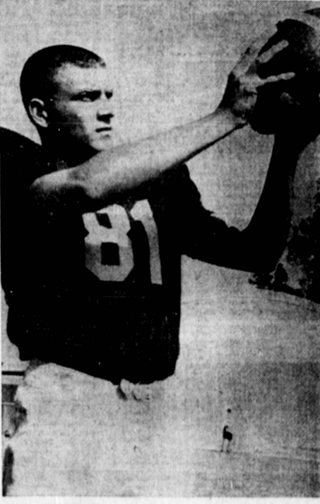
tars will be at left end when the team plays its home-coming game against Morningside. The visitors are