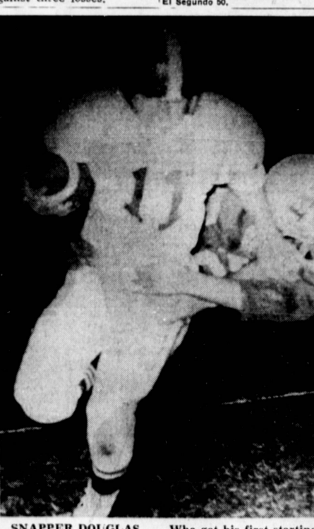
assignment for South High against Hawthorne last week is expected to be back in the saddle at Arcadia Friday night in a non-league game.