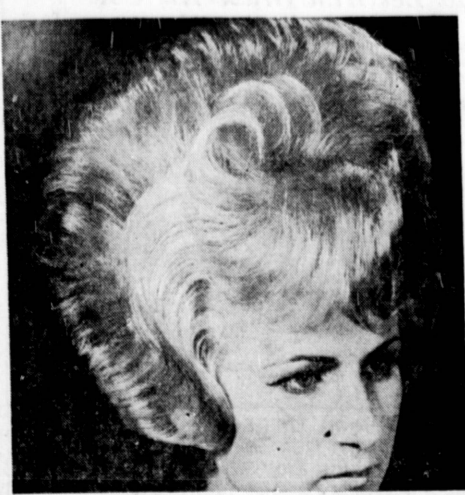
NEW STYLE ... One of the many new hair styles to be unveiled at the Miss Crowning Glory Beauty Show is shown here. The show, to be presented today from noon until 10 p.m. at the Ambassador Hotel, is the first such show. It is titled "A Vineyard of Beauty."