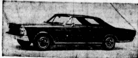
1966 FORD GALAXIE '500'