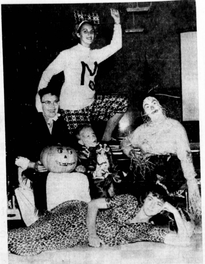
HALLOWEEN FOR KIDS?

From all PTAs comes the invitation to the public to "don your weirdest costume, come to the school, and join in an evening of Halloween festivities.