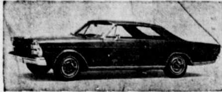
1966 FORD GALAXIE '500'