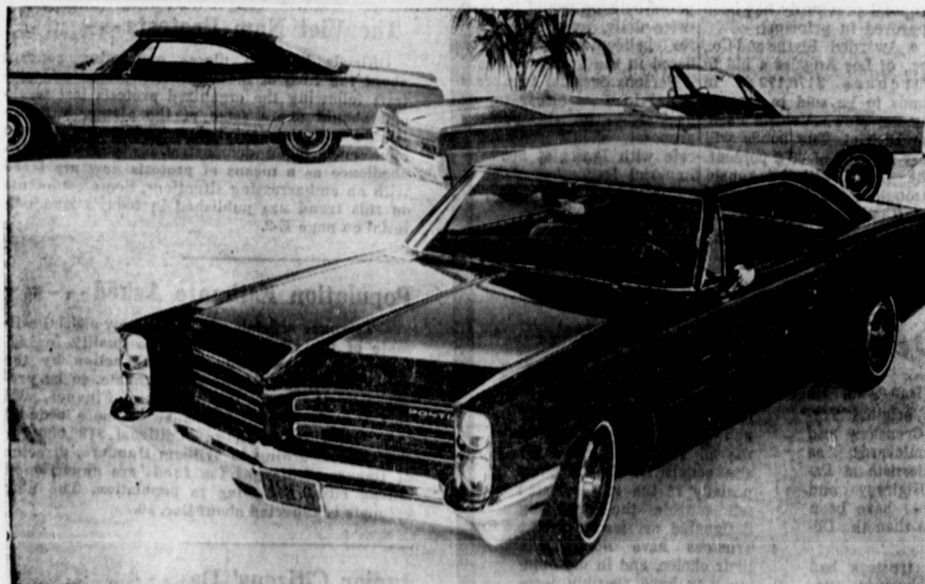
The '66 Star Chief Executive hardtop coupe in the foreground. Behind it is a Ventura, and behind that is a Brougham hardtop coupe.

3 new distinguished Pontiacs The Star Chief Executive for people who are looking for Bonneville-style luxury at Catalina-style prices. (Isn't everyone?)