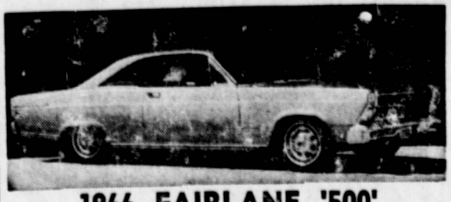
1966 FAIRLANE '500'