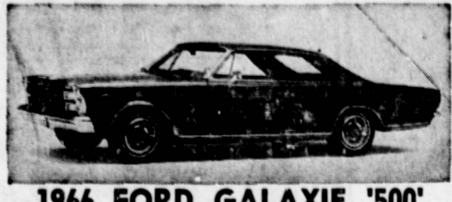
1966 FORD GALAXIE '500'