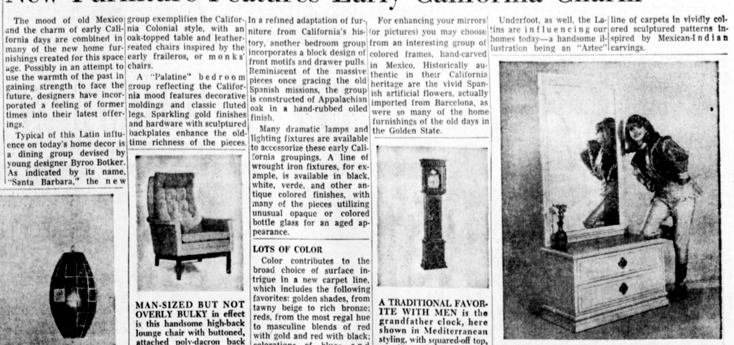
GIRLS ARE GIRLS, EVEN IN OUTER SPACE, so this versatile two-drawer chest from the "Cantania" Mediterranean collection appeals to any feminine taste. Suitable so many places! (Furniture Guild of Calif.)

A TRADITIONAL FAVOR-ITE WITH MEN is the grandfather clock, here shown in Mediterranean styling, with squared-off top, spool-turned supports, and open-scroll detailing. Offered in six popular finishes. (Rodum Manle)